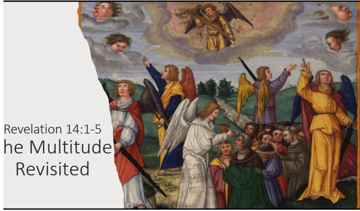
Revelation 14:1-5 The Multitude Revisited