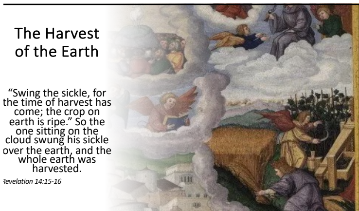
The Harvest of the Earth

“Swing the sickle, for the time of harvest has come; the crop on earth is ripe.” So the one sitting on the cloud swung his sickle over the earth, and the whole earth was harvested.